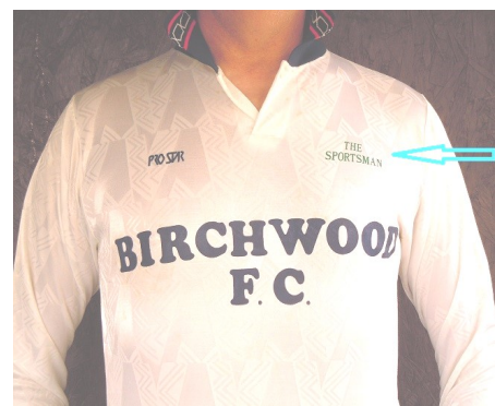
Birchwood Football Club shirt sponsored by a local company called The Sportsman

It is said that a community is not a community unless it can meet. One wonders where that could be nowadays!