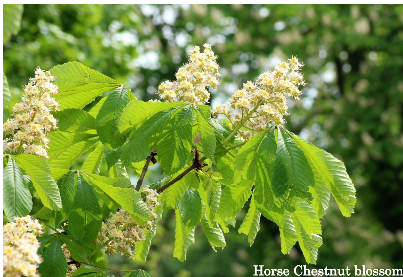
Horse Chestnut blossom

" We will succeed and that success will belong to every one of us..... We should take comfort that while we may have more still to endure, better days will return: we will be with our friends again; we will be with our families again; we will meet again."