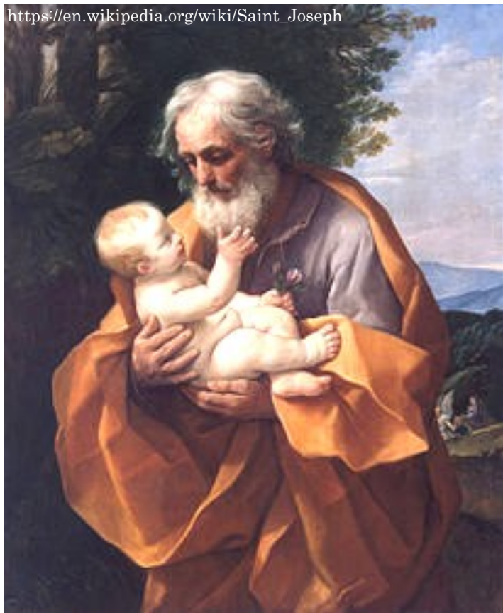
Saint Joseph with the Infant Jesus painted by Guido Reni, c.1635

https://en.wikipedia.org/wiki/Saint_Joseph