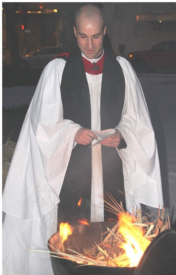
A deacon burning palm fronds from the previous Palm Sunday, for Ash Wednesday

My own experience, having been a Christian for nearly forty years, is that when I take the time to draw near and put myself in God's way, I'm seldom disappointed because He is faithful in his promise of drawing near to me.