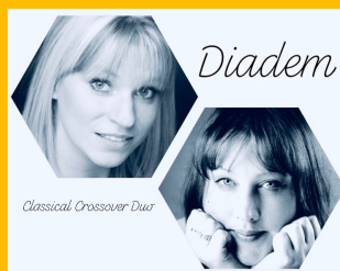
Diadem Vocal Duo

St Eth's Choir has been invited to sing Choral Evensong at St. Albans Cathedral. Please come and support them and enjoy the wonderful music in our historic cathedral