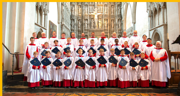
St. Albans Cathedral Choir