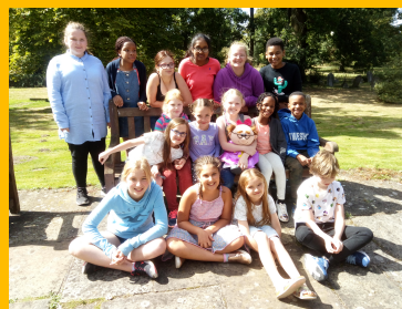
Y.E.S! (Young Eth's Singers)