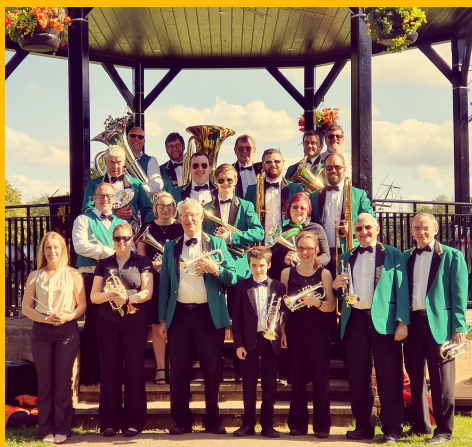
Welwyn Garden City Band

WELWYN GARDEN CITY BAND Saturday May 2nd. 7.30pm A brass band concert with British music at its best.