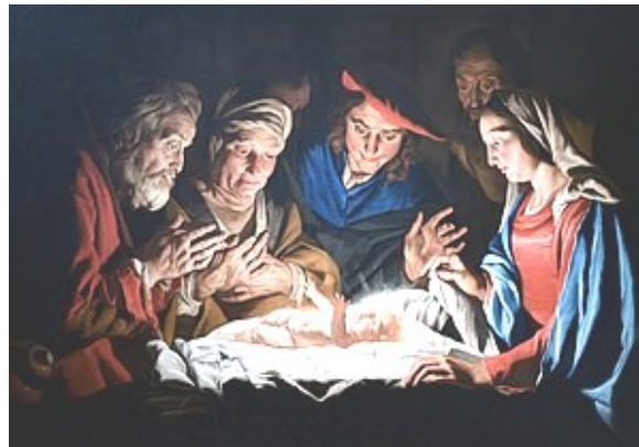
Adoration of the Shepherds by Dutch painter Matthias Stomer, 1632 *

We hear these words each Christmas season during our service of Nine Lessons & Carols. This profound message is that God Himself would come to earth as both King and Saviour.