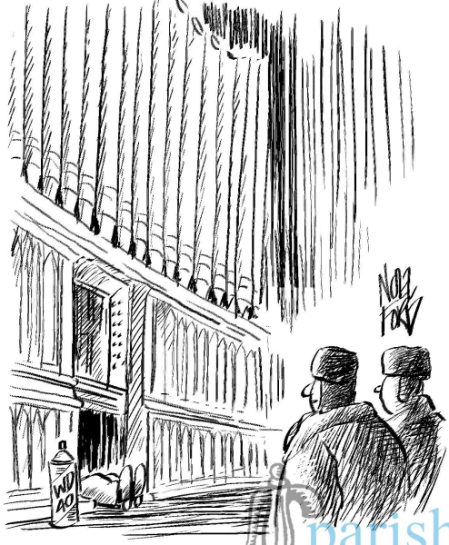
"It's a devil to start on these damp November Sunday mornings – luckily we have a sidesman who works for the AA"

I was sometimes asked to play for funerals in Welwyn Garden City and there in one of the churches is an organ that had just one manual and eight stops that were quite stiff to pull out and I imagine it's a bit like pulling pints in a pub, although I wouldn't know of course! It is a lovely and warm church. Here I was required to play music before the service and the hymns of course, but at the end as the coffin was carried out, taped music was going to be used. I said "going" but this didn't turn out quite as planned because when the poor girl put the required tape on, all we heard was a very weird sound coming from it because the tape was scratched. The poor girl's face was very red and she was in a bit of a state and informed me that she was going to give it another try. I felt tempted to tell her that the same thing would happen again but she was determined to give it another try but the result was the same. Consequently I had to provide the tune, which I knew well, and all turned out fine in the end. There were so many incidents I could record but as I played for more funerals than weddings, it could make boring reading.