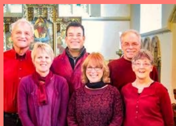
The Gamay Ensemble