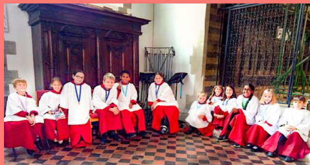
Y.E.S! (Young Eth's Singers)